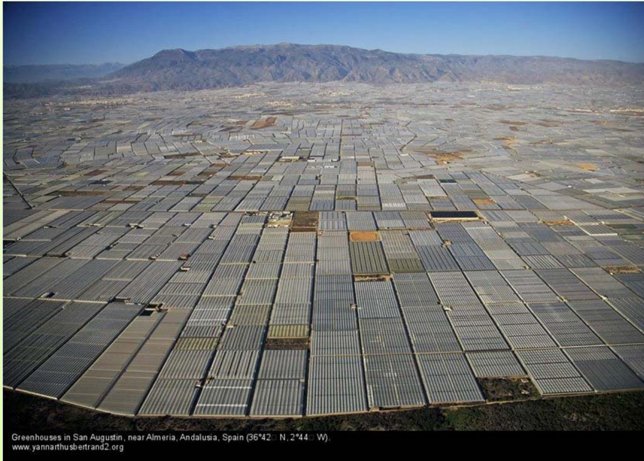
Greenhouses in San Augustin, near Almeria, Andalusia, Spain (36°42' N, 2°44' W).